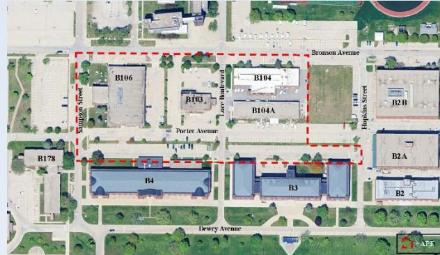
Figure 3 – Proposed APE Map for Building 103