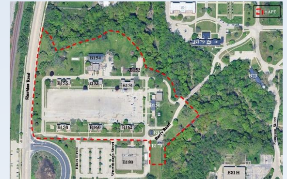
Figure 4 – Proposed APE Map for Buildings 151, 173, and 174