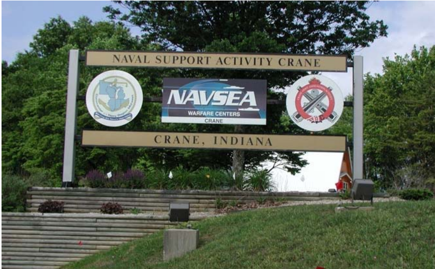
Main Gate at Naval Support Activity Crane

Public Works Department (PWD) Crane is pleased to present to you the 2015 annual water quality report (WQR). This report is intended to provide you with