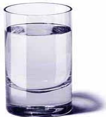
The source of JEB Little Creek's drinking water is from Lake Gaston, Lake Wright and Western Branch Reservoirs.

Naval Facilities Engineering Command (NAVFAC) Mid-Atlantic Environmental 341-0432