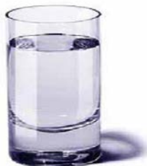
The source of NALF Fentress drinking water is from two groundwater wells that withdraw water from the water table aquifer.

In addition to these contaminants, all lakes and streams contain algae, which are microscopic plants that can cause taste and odor problems in drinking water.