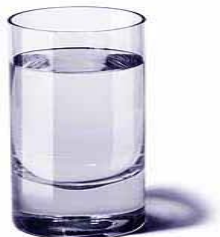
The source of JEB Little Creek's drinking water is from Lake Gaston and Lake Wright and Western Branch Reservoirs.

Naval Facilities Engineering Command (NAVFAC) Mid-Atlantic Environmental 341-0482