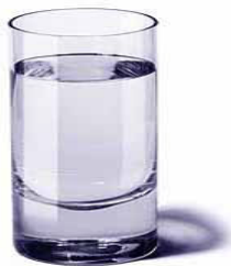
The source of NSA HR-Northwest Annex drinking water includes four deep wells.

The Virginia Department of Health conducted a Source Water Assessment of the NSA HR-Northwest Annex Waterworks in April 2019. All groundwater wells were determined to be of high susceptibility of contamination using the criteria developed by the state in its approved Source Water Assessment Program. The assessment report consists of maps showing the source water assessment area, an inventory of known land use activities of concern, and documentation of any known contamination within the last five years. The report is available by contacting PWD NSA Hampton Roads Environmental at 757-836-1862.